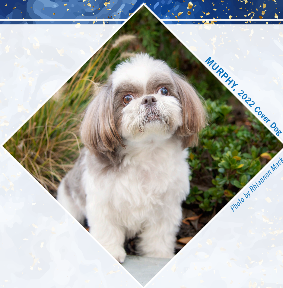
MURPHY, 2022 Cover Dog