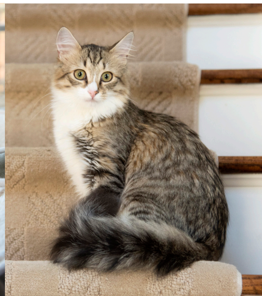
2021 CENTERFOLD KITTIES: Three, Goldie & Stormy